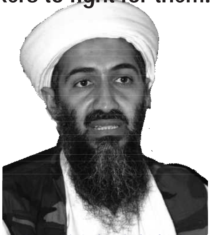
Osama Bin Laden, ringleader of the al Qa'eda group

Working with similar groups internationally they are imposing capitalist globalisation on the world's working class. At their 2001 meeting in Genoa they murdered one protester and hospitalised hundreds. This is part of a growing pattern of terror; they also shot 3 in Goteborg.